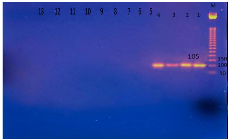
Figure. 1. Agarose gel electrophoresis of PCR products detection herpes simplex viruse-1 in Malignant. (1, 13) DNA ladder; (1,2,3,4) positive, negative (5,6,7,8,9,10,11,12,13) ,pb105 .