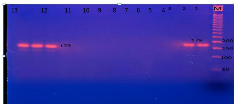
Figure. 3. Agarose gel electrophoresis of PCR products detection herpes simplex viruse-2 in malignant tumor. (1, 13) DNA ladder; (1,2,11,12,13) positive, negative (3-10) ,pb179 -pathological characteristics and HSV status in patients with thyroid cancer Clinico.