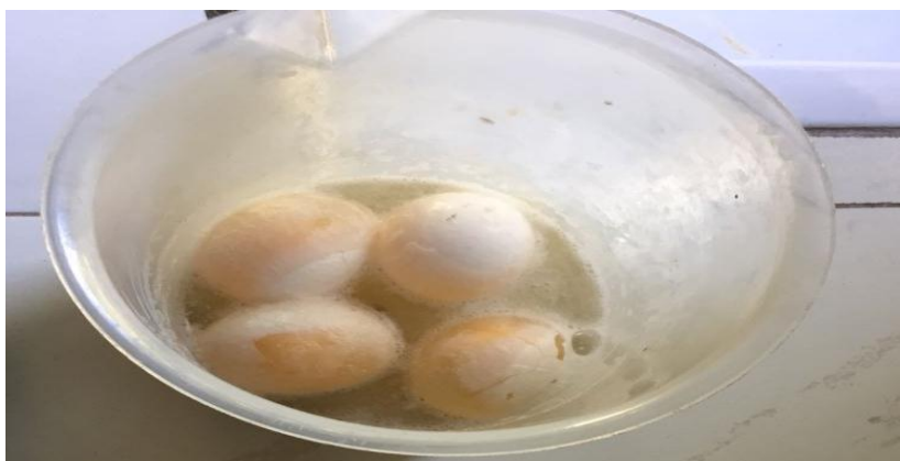
Figure 1(a): Decalcification of egg shell in 10% Acetic acid overnight.