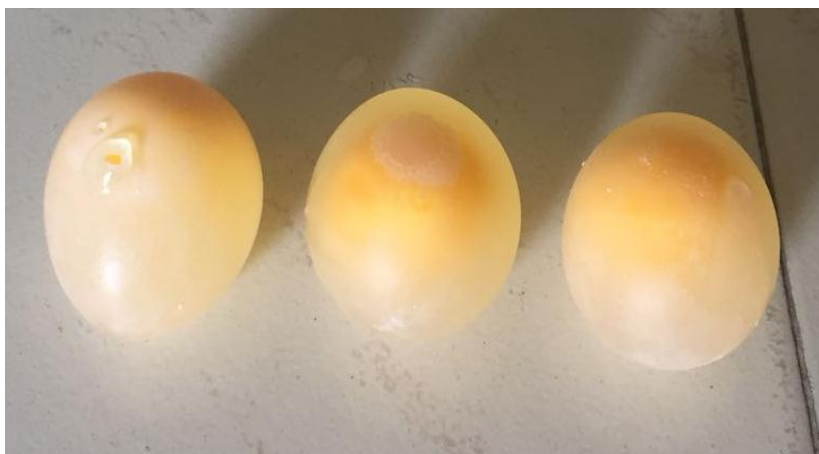
Figure 1(b): Decalcified Eggs