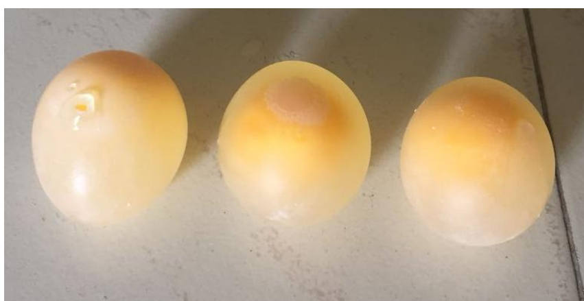
Figure 1(b): Decalcified Eggs.