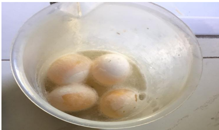
Figure 1(a): Decalcification of egg shell in 10% Acetic acid overnight.