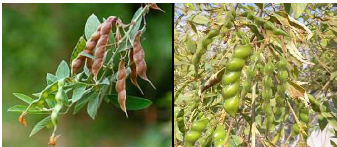
Fig. 3: Cajanus cajan plant and seeds of the Cajanus cajan .

Cajanus cajan is commonly called as Pigeon pea in English. This is a leguminous plant belonging to the family Leguminosae-Fabaceae. It is originated from Asia to East Africa and covered America around 3000 years ago. Pigeon peas are used as both a food crop (dried peas, flour, or green vegetable peas) and a forage/cover crop. They contain higher levels of proteins and the important amino acids like methionine, lysine and tryptophan, in combination with cereals, pigeon peas make a well-balanced human food. The dried peas may be sprouted briefly, and then cooked, for a flavour different from the green or dried peas. Sprouting is the process which enhances the digestibility of dried pigeon peas via the reduction of indigestible sugars that would otherwise remain in the cooked dried peas. Various works has been done on this plant as reported. But the bulk of the work was done on the seeds.