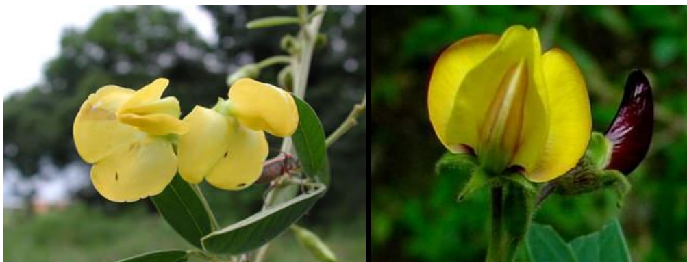
Fig. 2: Flowers of the Cajanus cajan .

Cajanus cajan is commonly called as Pigeon pea in English. This is a leguminous plant belonging to the family Leguminosae-Fabaceae. It is originated from Asia to East Africa and covered America around 3000 years ago. Pigeon peas are used as both a food crop (dried peas, flour, or green vegetable peas) and a forage/cover crop. They contain higher levels of proteins and the important amino acids like methionine, lysine and tryptophan, in combination with cereals, pigeon peas make a well-balanced human food. The dried peas may be sprouted briefly, and then cooked, for a flavour different from the green or dried peas. Sprouting is the process which enhances the digestibility of dried pigeon peas via the reduction of indigestible sugars that would otherwise remain in the cooked dried peas. Various works has been done on this plant as reported. But the bulk of the work was done on the seeds.